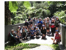
Year 7 & 8 Camp