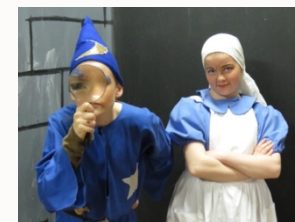
Whole School Production