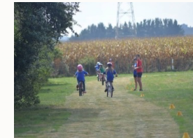
Fordell School Do-Athlon