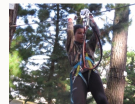
Year 7 & 8 Tuia Challenge