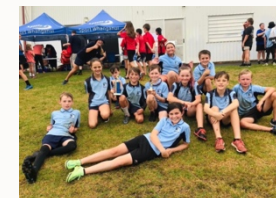
Fordell School Touch