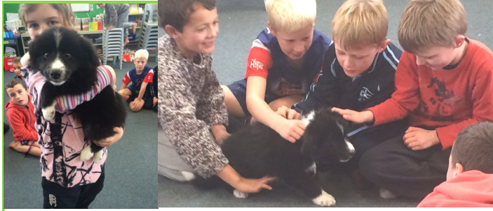
Room 4 thinks it would be a great idea if we could bring our pets to school every day!