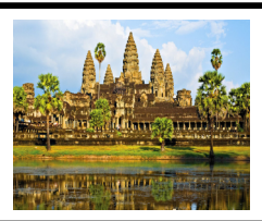
The Angkor Wat Temple in Cambodia!

In Room 1 we only have to write one report a term. Last week we wrote a report on a country of our choice, displaying our knowledge about the food, clothing, culture, climate and famous landmarks of that country.