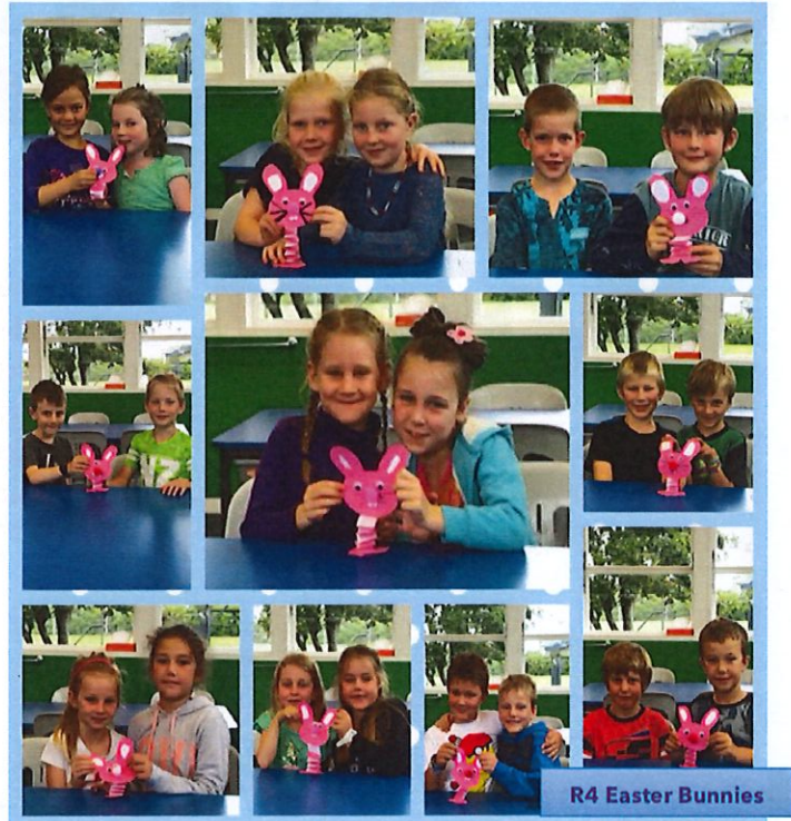
R4 Easter Bunnies