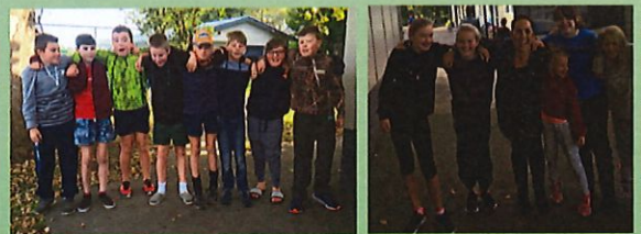
#Fordell Friendship Chains ☺

Fordell - where great friendships are made!