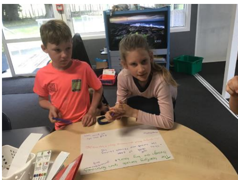
Working on our sentence with a buddy.

Scan the QR code to view our other word clouds