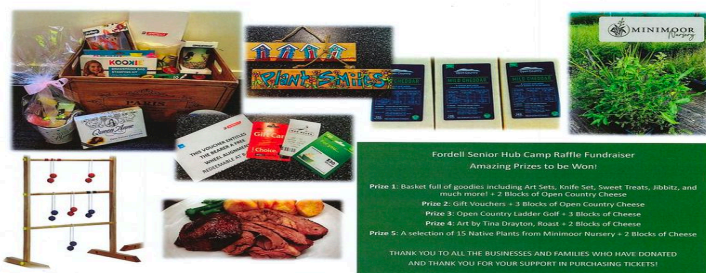
Fordell Senior Hub Camp Raffle Fundraiser Amazing Prizes to be Won! Prize 1: Basket full of goodies including Art Sets, Knife Set, Sweet Treats, Hibitz, and much more! + 2 Blocks of Open Country Cheese Prize 2: Gift Vouchers + 3 Blocks of Open Country Cheese Prize 3: Open Country Under Gift + 3 Blocks of Cheese Prize 4: Art by Tina Drayton, Roast + 2 Blocks of Cheese Prize 5: A selection of 15 Native Plants from Minimoor Nursery + 2 Blocks of Cheese THANK YOU TO ALL THE BUSINESSES AND FAMILIES WHO HAVE DONATED AND THANK YOU FOR YOUR SUPPORT IN PURCHASING TICKETS!

The senior hub (Year 5 - 8 ) are running a raffle for their end of year camps. There are some fantastic prizes to be won, including a heap of vouchers (more than what is pictured). Tickets can be purchased from the office only $2 each and is drawn next week. So get in quick.